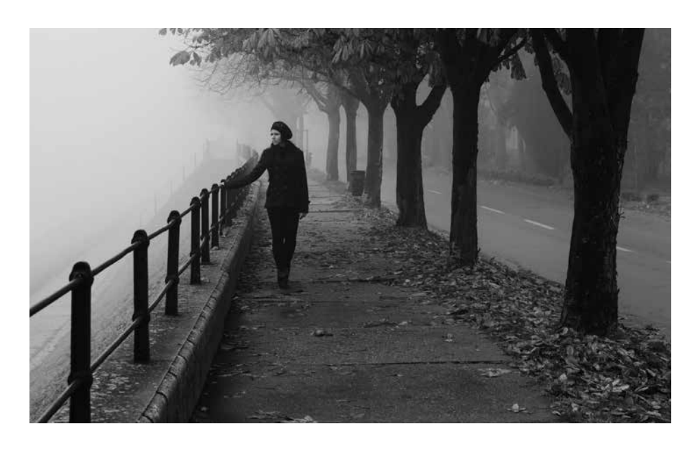
ZARIAH HEDGE San Jacinto College – North Campus Texas

I wander down the block to clear my head and gain some semblance of control over my emotions. I head in the general direction of the nearest park.