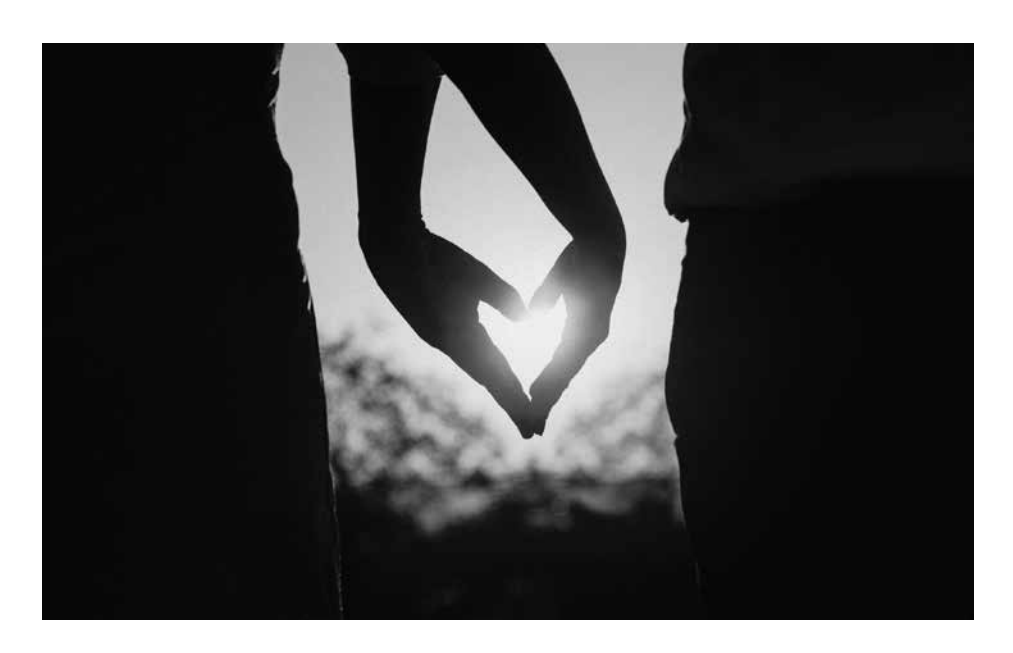
CASSIA ROSE Northeast Texas Community College Texas