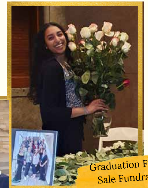
Graduation Flower Sale Fundraiser