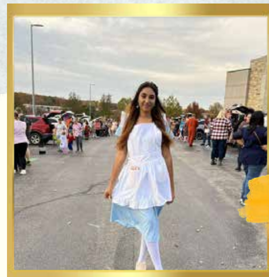
Trunk or Treat community event and fundraiser