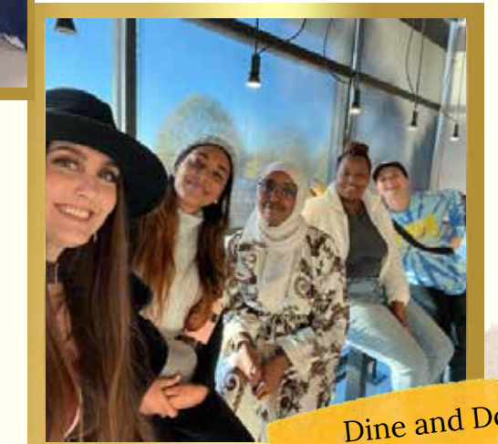
Dine and Donate fundraiser at Chipotle