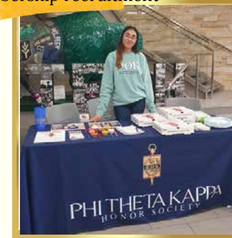
PTK info table for membership recruitment